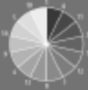
Makita's Efficient Hammering